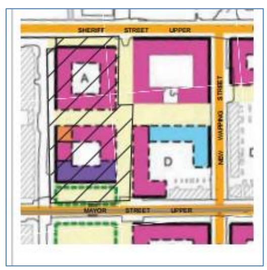
Fig. 1: Fixed Building Lines